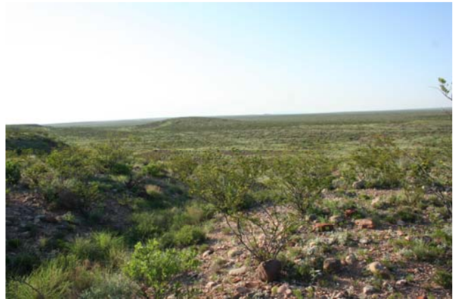
Yost Draw on the Camino's Jornada del Muerto.

Each year communities throughout New Mexico hold Heritage Preservation Month events that range from architectural tours, hikes to archaeological sites – some of them usually off limits to the public, lectures and demonstrations at state parks and monuments, festivals, workshops and community celebrations. They are all published in the Historic Preservation Division's Calendar of Events ,