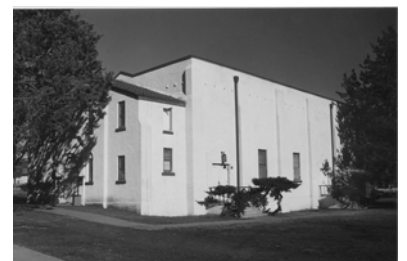
WPA Theater at Fort Bayard