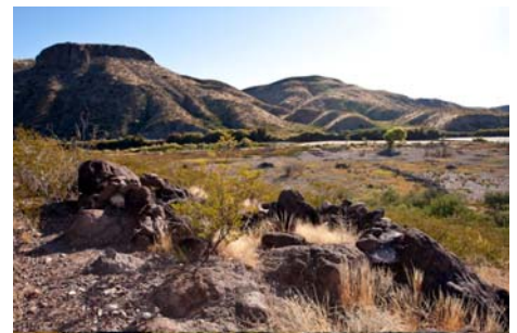
Ranch photo