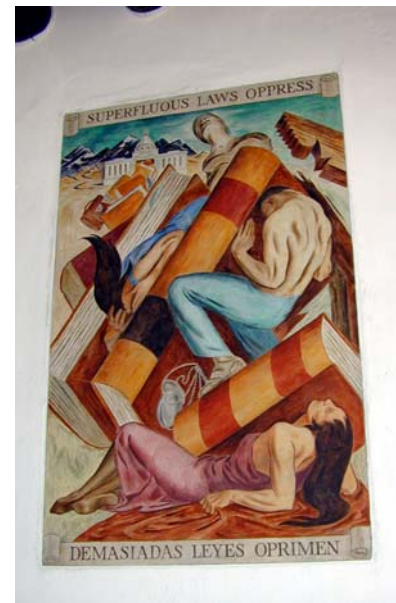
One of a series of New Deal murals in the historic Taos County Courthouse off the Plaza.