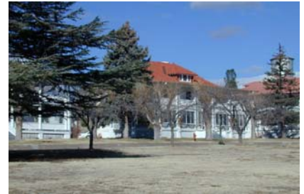
Commanding Officers Headquarters