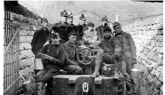
Vintage postcard of miners, courtesy off the park.

Attend an outdoor church service with a traveling “cowboy” preacher, then watch young baseball players re-create the rivalry between coal camp teams. Refreshments provided. I-25 exit 452 at Raton and travel east about six miles to park visitor center. Contact: patricia.walsh@state.nm.us ; 575-445-5607.