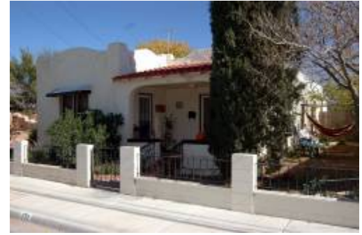
Historic home on Mesquite St.