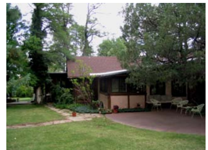
Oppenheimer Cabin at Fuller Lodge.