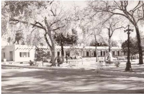
The Palace of the Governors in Santa Fe was built in 1610.

The first recorded contact between Europeans and native peoples occurred in 1539 when Esteban de Durantes, a Moorish slave, led Fray Marcos de Niza into the area that would become New Mexico. In spite of Fray Marcos de Niza's failure to discover the legendary Cities of Gold, Spanish noblemen, soldiers, clergy, servants and craft peoples began to explore "New Spain" in a series of entradas (entrances). By 1598 the Spanish had established a permanent settlement near the pueblo of San Juan, named San Gabriel de Yunque Owinge. As colonization continued, the region received new immigrants and goods from the Spanish Empire by way of El Camino Real de Tierra Adentro trail between Mexico City and the Santa Fe area. During this period Santa Fe was first established, only to be abandoned by the Spanish during the Pueblo Revolt of 1680-1692. In addition to European goods and people, Catholicism, horses, diseases, architecture, plants, and a myriad of cultural traits arrived with the Spanish.