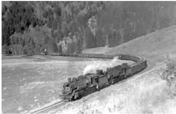
Railroads made and broke towns and cities in New Mexico. The Cumbres and Toltec is one of the oldest narrow-gauge trains still running in the United States.

The Territorial Period: When the United States declared war on Mexico, General Stephen Kearny of the United States Army left Fort Leavenworth, Kansas, with an armed force to begin his march on Mexico via the Santa Fe Trail. Fearing the worst, many New Mexicans fled to the countryside, while Santa Fe prepared for invasion. Although a Mexican militia was raised, the Mexican colonial government decided not to defend the capital. By August 1846, Kearny had captured New Mexico without firing a shot. During the Mexican-American War of 1846-1848, the United States military presence in New Mexico grew, and subsequently territorial forts were established across the region.