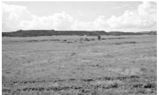
The Santa Fe Trail became a major east-west trade route from Santa Fe to Independence, Missouri.

The Mexican Period: Before Mexico's independence from Spain, trading in New Mexico had been strictly controlled and enforced by the Spanish. Several unsanctioned Anglo and French trading parties were arrested for violation of Spanish colonial policy. With independence, the Mexican government reversed this policy and encouraged the exchange between Americans and New Mexicans. In 1821, William Becknell led a trading expedition from the Midwest, across the Great Plains into Santa Fe. The establishment of the Santa Fe Trail resulted in an increased availability of consumer goods. Cash, however, was a scarce commodity in New Mexico as the commercial system at this time was a subsistence economy. Citizens traded labor and locally-produced goods with each other. Most regional construction continued to use traditional adobe and rough-hewn timber.