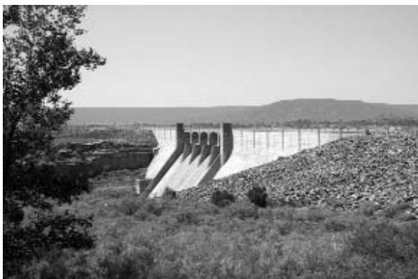
New Deal projects changed the face of New Mexico. Conchas Dam was the largest Depression-era construction project in the state.