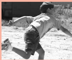
Lessons in the ancient art of propelling a spear with an atlatl draw hundreds of participants each year.