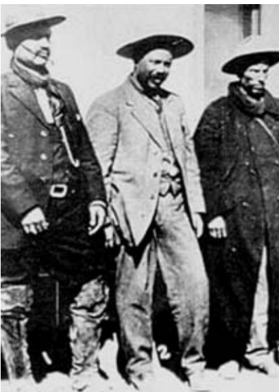
Pancho Villa flanked by two of his officers. Columbus conducts walking tours and holds events related to Pancho Villa's March 9, 1916, raid of Columbus, which was the last invasion of U.S. soil by a military force.

Created in an amendment to the National Historic Preservation Act, the CLG program reflected the need of local governments to have a stronger voice in federal projects and preservation matters. Communities develop local ordinances to protect historic resources and form design review boards that monitor activity in historic districts. Often part of a local planning office, CLGs are eligible for a portion of the approximately $85,000 HPD sets aside each year from the federal Historic Preservation Fund as grants.