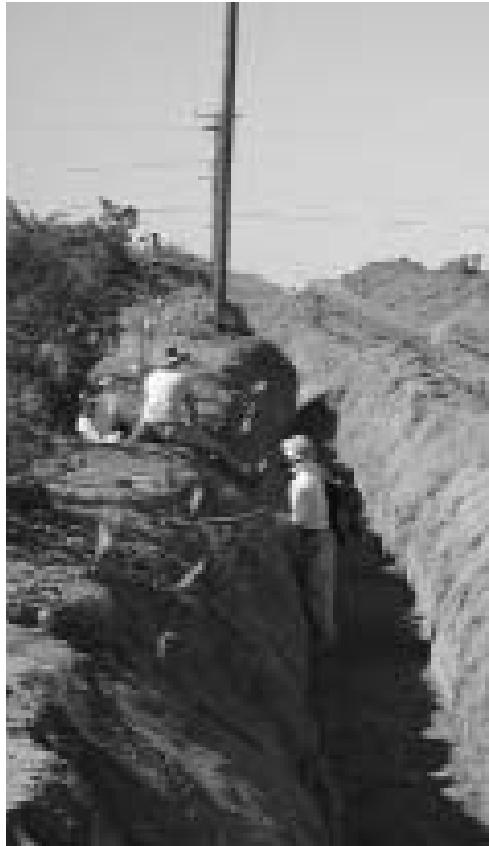
Archaeologists conduct tests during trenching for the new line.

Preservation Award. The city contacted local media and conducted several public meetings as the ruins were unearthed, in accordance with state law. The city also began planning an interpretive display of the discovery giving new and old residents alike a better understanding of their community.