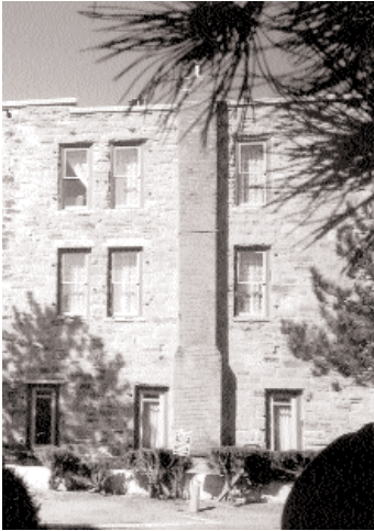
The east facade showing restored windows. The hotel was built in three phases beginning in 1892.

The Eklund Hotel on Clayton's Main Street, in Union County, once was known to travelers along the Colorado and Southern Railroad as "the finest hotel between Fort Worth and Denver." Completed in 1905, it was the first hotel in Clayton to have electric lights and in-room telephones. Black Jack Ketchum was hanged for train robbery nearby and a bullet hole from his gun still is easily visible in the saloon's tin ceiling.