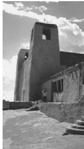
San Estéban del Rey at Acoma