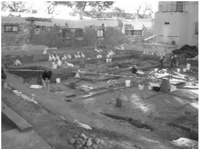
The north wall of the 400-year-old Palace of the Governors was stripped of its plaster and archaeologists excavated for more than a year behind it in preparation for construction of a new history museum to be completed in 2008. Artifacts recovered dated from 1610 – 1950 and included Spanish cobbled foundation walls, ceramics, human burials, military buttons and bullets. The excavations required a permit from CPRC.

A CPRC task force including HPD staff and archaeologists from three state agencies began the revisions in 2004. Rules for issuing permits, archaeological surveying, testing, excavating and monitoring were rewritten and streamlined. They were implemented in January 2006 following public meetings and a formal hearing.