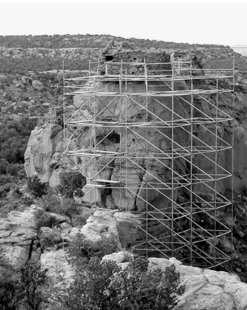
Planning the stabilization of the Navajo pueblo, Three Corn Ruin, was made possible, in part, through an HPD-administered grant.

New Mexico's cultural resources vary widely. They are documented in the 1,900 listings in the State Register of Cultural Properties and inventoried in the 154,000 archaeological sites found in our Archaeological Resources Management Section database. These resources tell the story of millennia-old human occupation in New Mexico. From the birthplace of American rocketry at White Sands Missile Range — a registered Cold War site — to the 11,000 year-old communities of hunters and gatherers at Black Water Draw, New Mexico cultural resources weave the fabric of the state's heritage.