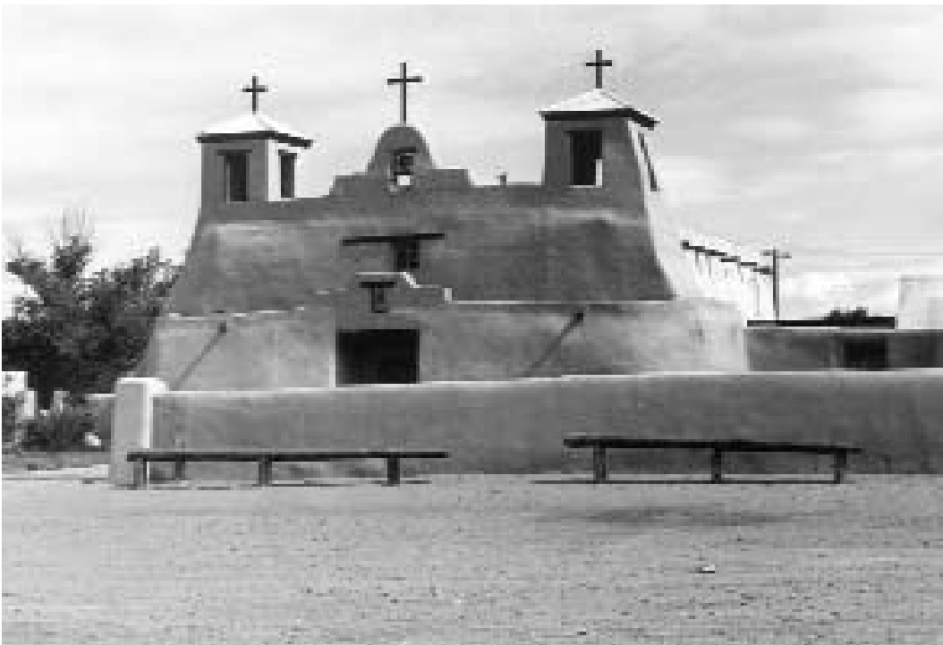
San Augustin church at Isleta Pueblo dates to 1612, and is one of the two oldest churches in the state. It is one several dozen resources that could be lost from Rio Grande flood waters.

• In the early summer of 2003, a wildfire erupted on Virgin Mesa, near Jemez Springs, in the Santa Fe National Forest. Using the cooperative data-sharing agreement, HPD and U.S. Forest Service archaeologist quickly generated a GIS map layer of archeological sites in the area of the blaze. Fire-fighting personnel were able to coordinate ground-disturbing activities, minimizing direct damage to known prehistoric and historic archeological sites. NMCRIS data were also used to assess post-fire damage.