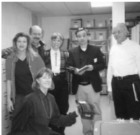
HPD, New Mexico Heritage Preservation Alliance and the CPRC in Roswell for Preservation 101 with Main Street.

HPD provided information about the State and National registers, financial incentives, grants, and Heritage Preservation Month to Hobbs, Farmington, Clovis, Roswell, Clayton, Artesia, Las Cruces, Las Vegas, Tucumcari, Gallup, Silver City, Bayard, Bernalillo and Portales.