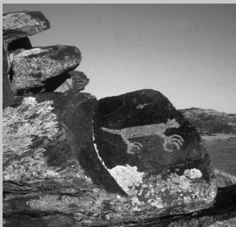
There are thousands of petroglyphs in Galisteo Basin.

Governor Bill Richardson extended the temporary moratorium on oil-and-gas drilling in Galisteo Basin until January 24, 2009, and called on DCA to begin to plan surveys and studies to identify cultural resources and develop a more appropriate resource-based planning process.