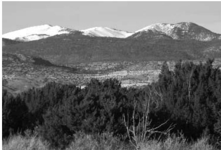
The Navajo believe their creator placed them on land between four mountains representing the cardinal directions, with Mount Taylor being the sacred mountain of the south. Mount Blanca near Alamosa, Col., is the easternmost sacred mountain and also the tallest in the Sangre de Cristo range. San Francisco Peak, near Flagstaff, Ariz, is the the sacred mountain of the west and Mount Hesperus near Durango, Col., the north.

Hiking continues unimpeded, so does hunting, and private landowners have not lost grazing rights or access to land that some of them trace back to Spanish land grants