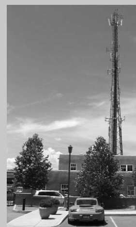
A radio tower in the heart of the Santa Fe Historic District is used by cell phone companies. A 2002 FCC programmatic agreement regulates the industry, including the location of towers and antennas.

Glorieta National Monument see HPD revisiting extensive tribal consultation and Section 106 project review under a 2002 Memorandum of Agreement. Rio Arriba County banned cell tower construction for nine months after a tower went up in the viewshed of Santuario de Chimayo.