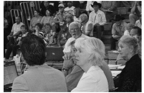
The CPRC meeting in Grants.

Persons who have applied for HPD's federally funded grants also are eligible to apply for the state grants. Grants should conform to the goals outlined in Preserving the Enchantment: A Plan for New Mexico, 2007 – 2011 , the division's state plan, which is found on our website. Expansion and strengthening of public knowledge, increased historic preservation funding, incorporating preservation into community planning, and developing a strong statewide preservation network of organizations and individuals are among the goals.