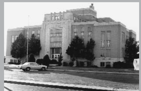
Roosevelt County Courthouse

The Lovington Fire Department Building solved several problems in the growing town. Also a WPA project, it doubled as Lovington's first city hall and fire house, lowering fire insurance rates for the whole town. It still is used today as an auxiliary building for the department.